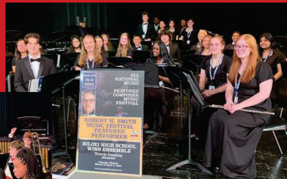
The Biloxi High School Wind Ensemble